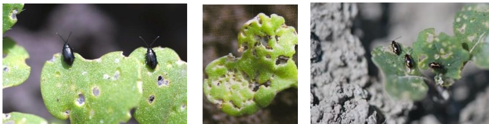
Flea beetles feeding on, damaging canola cotyledons

Canola is a high-management crop to grow, with the first challenge being obtaining an adequate stand during emergence. The canola plant's major pest – flea beetles – is quite predominate in regions where canola is grown, and small emerging canola seedlings in the cotyledon stage are very susceptible to flea beetle infestations which can cause substantial damage to or destroy cotyledons in a short period of time.