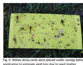
Fig. 4. Yellow sticky cards were placed under canopy before application to estimate yield loss due to seed shatter.