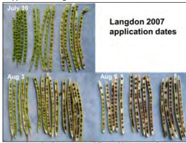
Fig. 3. Seed color in top, middle, and bottom pods at application at Langdon in 2007.