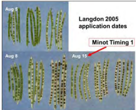
Fig. 1. Seed color in top, middle, and bottom pods at application at Langdon in 2005.