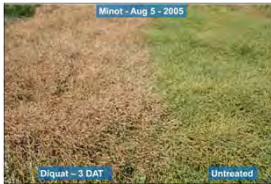
Fig. 5. Comparison of diquat vs. untreated at 3 DAT.