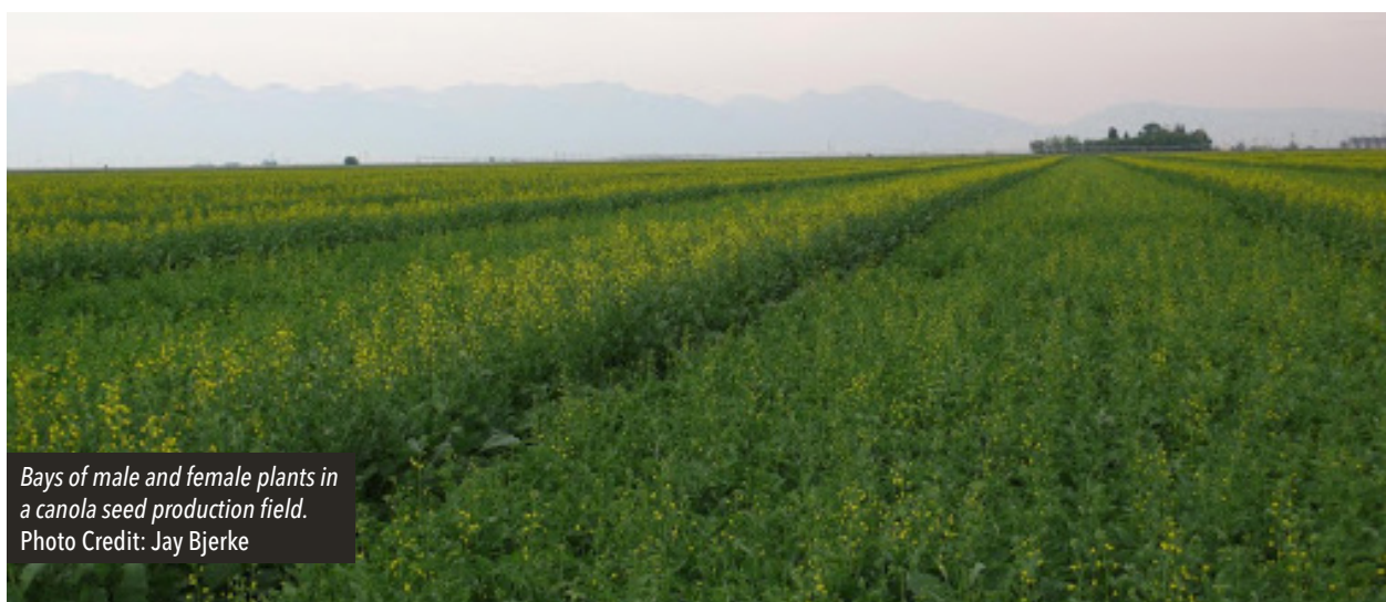
Bays of male and female plants in a canola seed production field.