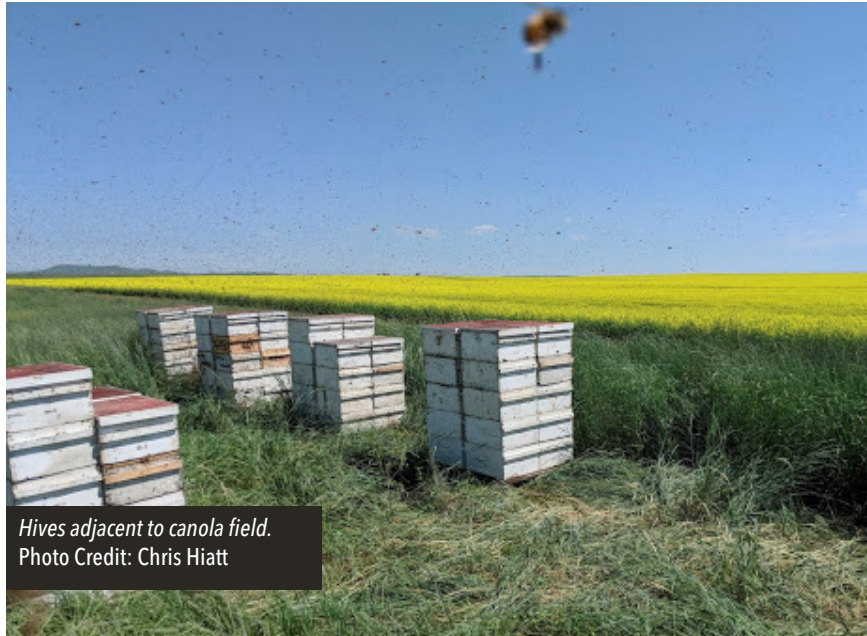
Hives adjacent to canola field.